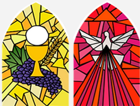
Communion | Confirmation